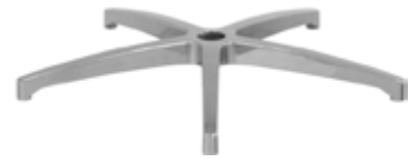
5-star die-cast aluminium Ø 700 mm base, polished, ø 700 mm.